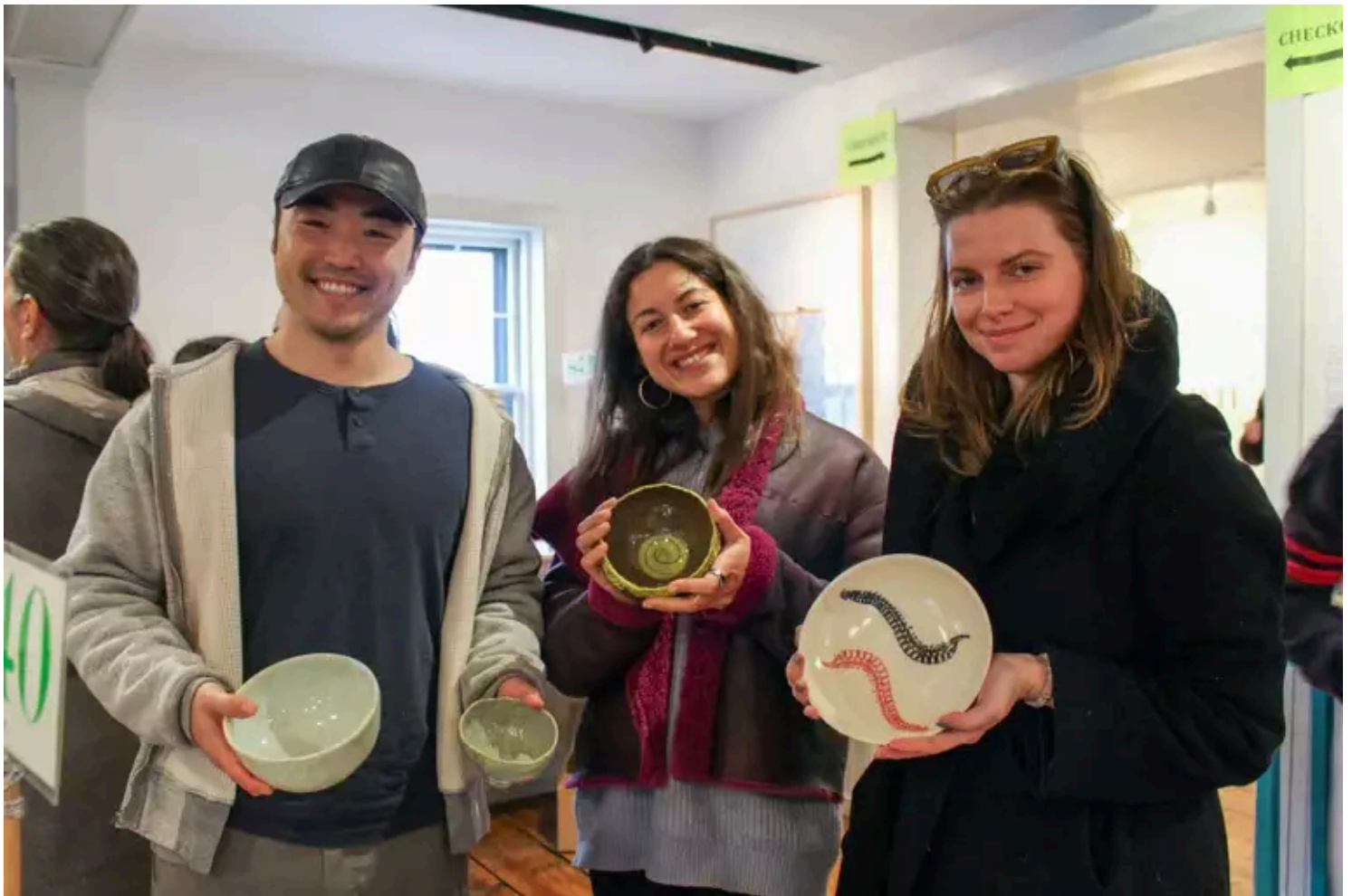
Women's Studio Workshop's annual Chili Bowl Fest fundraiser returns displaying hundreds of handmade bowls and mugs for purchase with all sale proceeds supporting the studio from 2-7 p.m. on Saturday.